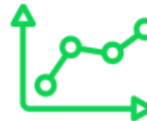
BUILT-IN CALCULATIONS & PRE-CALCULATED RESULTS INSERTION