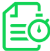
CONFIGURABLE AND DOWNLOADABLE CONTROLS & ERROR LOGS