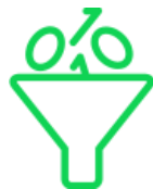
FLEXIBLE DATA COLLECTION