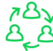
COMPLETE WORKFLOW & USER MANAGEMENT