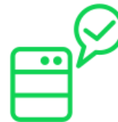
MANAGED SERVICE OR SAAS SOLUTIONS AVAILABLE