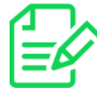
AUTOMATED REPORT PRODUCTION